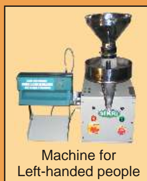
Machine for Left-handed people

Foot switch to run the machine - keeping both hands free for faster production.