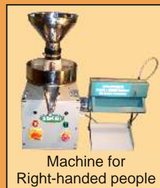
Machine for Right-handed people