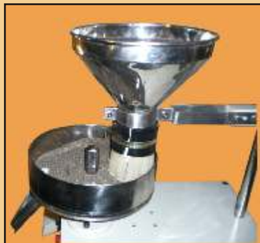
Hopper & Filler